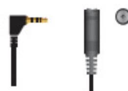
• De-tacheable MIC