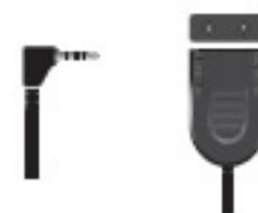
• AV Switching Box