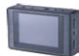
• Portable DVR Series