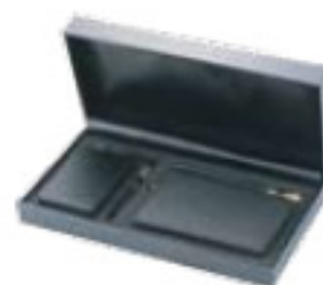
• Wireless RF Kits