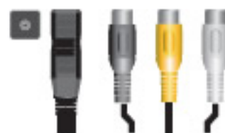
• Switching Cable