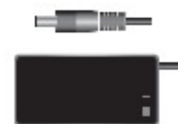
• Battery Holder